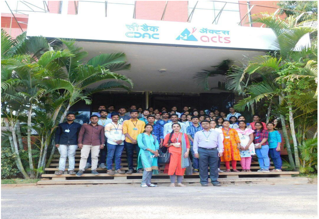
C-DAC Bangalore (27February2018)